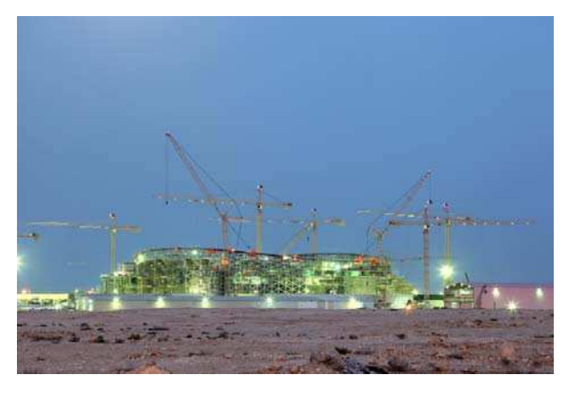
Construction in Qatar may help it ride out the initial storm.

Both private and state-owned firms are starting to restructure to reduce costs and increase efficiency now that the boom is over. They are merging divisions or outsourcing certain functions, introducing performance-related earnings, offering redundancies or smaller pay increases to staff. Qatar ought to be able to continue awarding annual salary increases given the continued investment in areas such as construction thanks to the 2022 football World Cup. But others, such as Saudi Arabia – most exposed to oil price fluctuations and subject to wide-ranging public sector cuts – will likely see redundancies at a time when the rate of inflation is high and subsidies are declining.