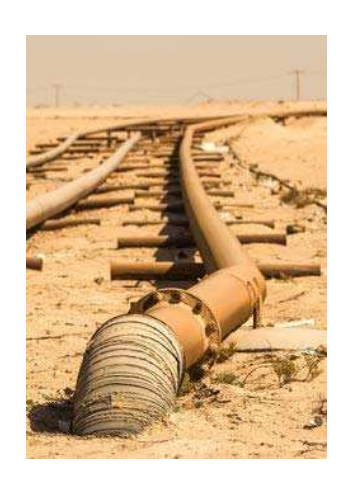
Cracking under pressure?

Having said that, it is not all doom and gloom just yet. During an economic downturn, the decline in some sectors could be offset by growth in others. For instance, the population is growing quite quickly in the GCC region and firms are legally required to provide employee health insurance. The frequent shortage of qualified medical staff in the region means that physicians ought to be in high demand at the moment and the health sector should be looking to ride out the direct effects of an oil price decline.