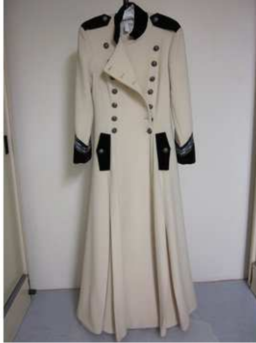
Figure: 7. Long, full skirted coat inspired by Russian military wear, by UK fashion designer, Rifat Ozbek, 1993.