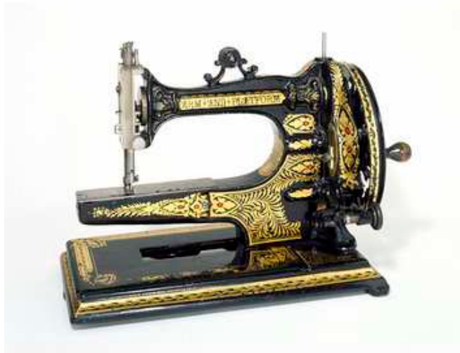
Figure: 10. Early sewing machine produced in the UK, circa 1880 (unknown production).