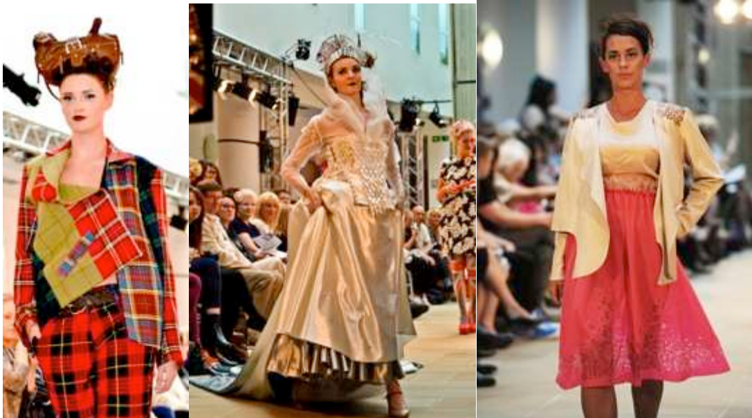
Figures: 1 – 3. Fashion garments presented in a fashion show, 2013.

the show or collection, the models preen and pose in the garments, inviting the audience to step into their captivating world. Items of clothing are promoted and sold in less ostentatious ways, through static displays at trade shows, online or through agents and specialist suppliers for uniforms or corporate clothing outlets.