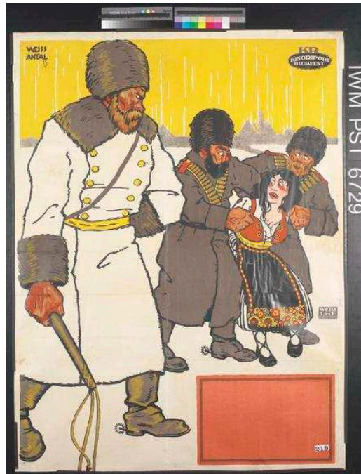
Figure: 6. Russian military uniform. Courtesy of the Imperial War Museum.

The emphasis here is on the extinction of the fashionable garment however fashion trends can be inspired by items of clothing such as military uniform, such as the Russian coat by Rifat Ozbek, illustrated in figures 6 and 7. Once such trends are exhausted as a fashion look, their sources of inspiration (in this case military clothing) remain as clothing items. Extinction only applies to the condemned status of the fashionable style, not the durability of the clothing style.