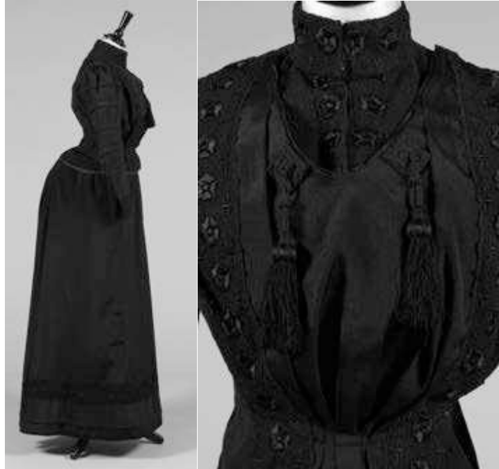
Figures: 8 and 9. Victorian mourning costume from the 1880's, which incorporates the fashionable bustle silhouette.

Sewing is the craft of securing objects using stitches made with a needle and thread. It dates from the prehistoric period and until the 19 th century all sewing was done by hand. The mass production of sewing really accelerated after the invention and patenting of the sewing machine in the late 19 th century and an example of such a machine is illustrated in figure 10. The rise of computerized manufacturing in the late 20 th century is a further technological development that has accelerated the production of clothing and this has greatly abetted the rise of fast fashion. Fast fashion is a term used by fashion retailers and describes how designs from the catwalk are quickly adapted into high street trends. These trends are designed and manufactured quickly and cheaply so the consumer can purchase fashionable styles at a lower price. Large, global retailers such as, Zara, Topshop, Peacocks and H&M, have developed and maintained lucrative businesses based on these ideas of quick production at affordable prices.