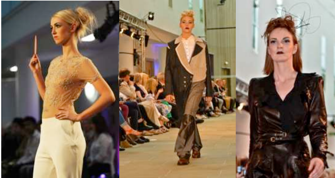
Figures: 11, 12 and 13. Typical fashion garments produced from BA (Hons) Fashion Design with Marketing and Production, University of Huddersfield in the UK.

I decided to evaluate the London College of Fashion, course website in order to identify any undergraduate courses that focused upon clothing. The London College of Fashion is the largest provider of fashion education in the UK and it is interesting to note there is no equivalent College of Clothing in the capital city. I discovered 40 undergraduate courses and the majority of these had fashion in the course title, only BA (Hons) Bespoke Tailoring did not. This particular course described the programme of study as being a “Specialist degree for those who want a career in bespoke tailoring. Whether you aspire to Savile Row or alternative bespoke destinations, this is the course for you” (London College of Fashion, 2014). Refreshingly the description did not imply that bespoke tailoring was solely for fashion, which intimates that the skills acquired could potentially be applied to career paths in tailoring across the spectrum of clothing and fashion industries.