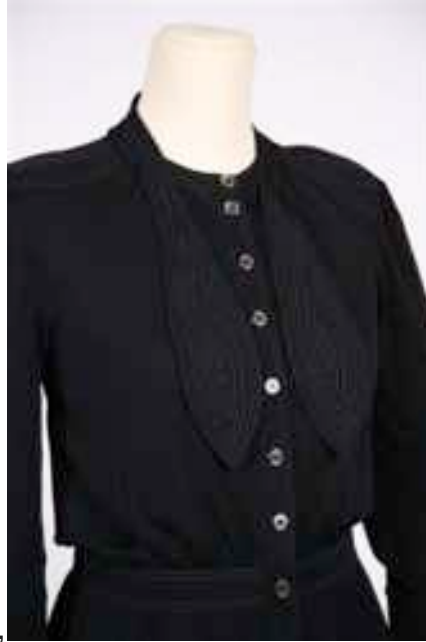
Figure: 4. Jean Muir black rayon jersey cape dress, approx. 1980.