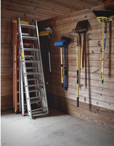
10) Ladder, Digital Photograph, 17" x 11", 2021, Murt_Ladder.jpeg