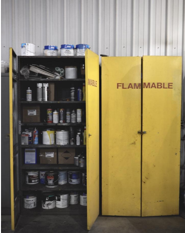
8) Flammable, Digital Photograph, 17" x 11", 2021, Murt_Flammable.jpeg