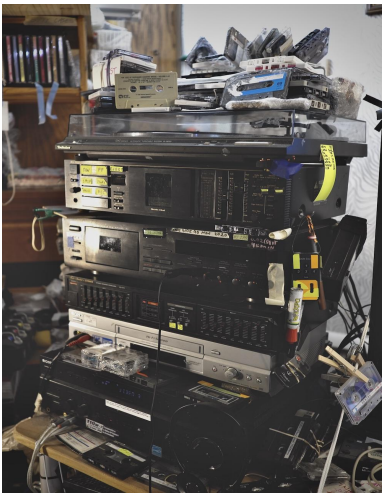
4) Stereo, Digital Photography, 17" x 11", 2020, MurtConner_Stereo_4.jpeg