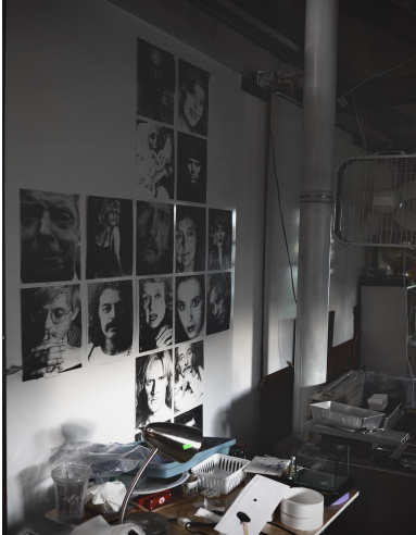
3) Celebrity, Digital Photography, 17" x 11", 2020, MurtConner_Celebrity_2.jpeg