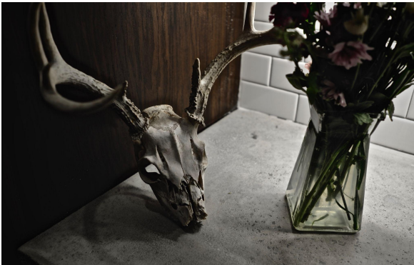
6) Skull, Digital Photograph, 11" x 17", 2018, Murt_Skull.jpeg