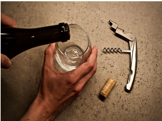
13) Orin Swift, Digital Photograph, 11" x 17", 2018, Murt_OrinSwift.jpeg