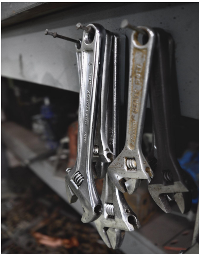
9) Tool, Digital Photograph, 17" x 11", 2021, Murt_Tool.jpeg