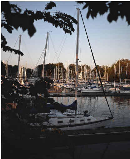
7) Harbor, Digital Photograph, 17" x 11", 2020, Murt_Harbor.jpeg