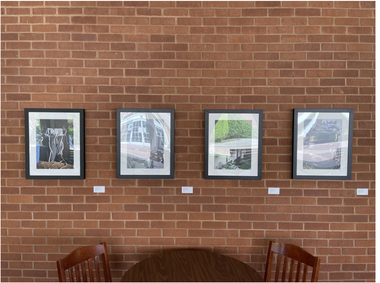
Exhibition Install Photo