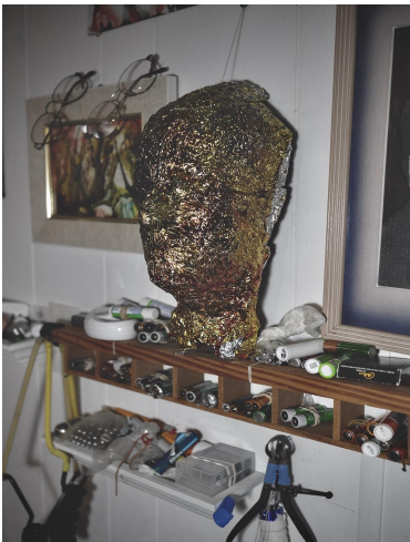
2) Battery Storage, Digital Photography, 17"x11", 2020, MurtConner_BatteryStorage_3.jpeg