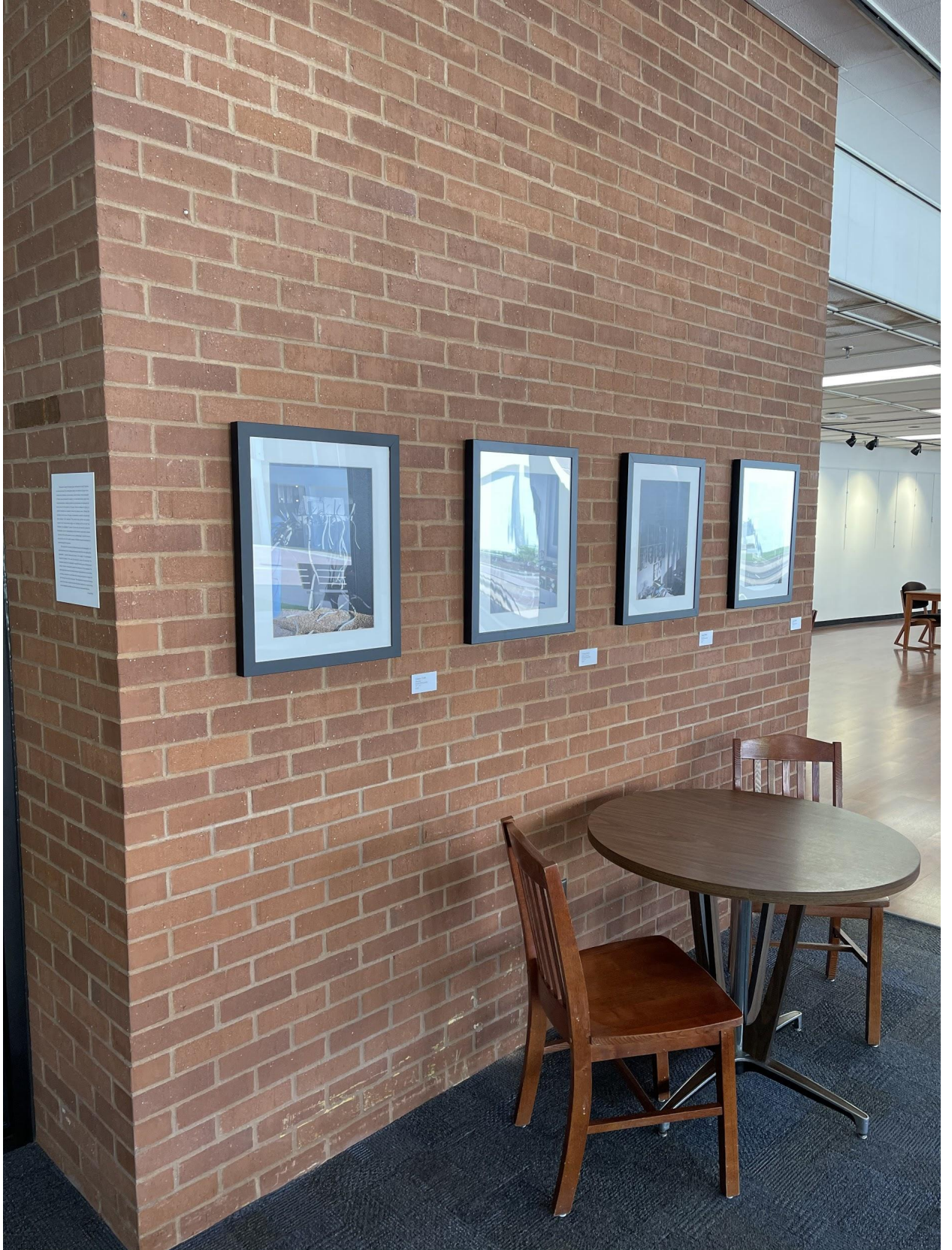
Exhibition Install Photo