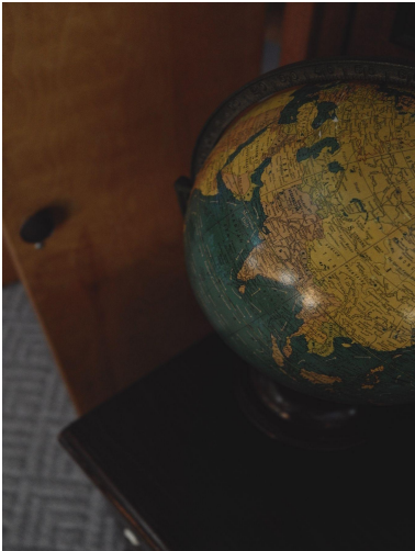
11) Globe, Digital Photograph, 17" x 11", 2021, Murt_Globe.jpeg