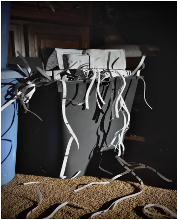
1) Shredder, Digital Photography, 17" x 11", 2020, MurtConner_Shredder_1.jpeg