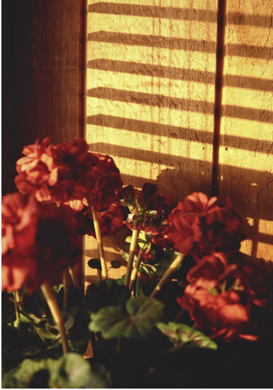
12) Cast Shadow, Digital Photograph, 17" x 11", 2021, Murt_CastShadow.jpeg