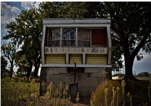
5) Mobile Home, Digital Photograph, 11" x 17", 2018, Murt_MobileHome.jpeg