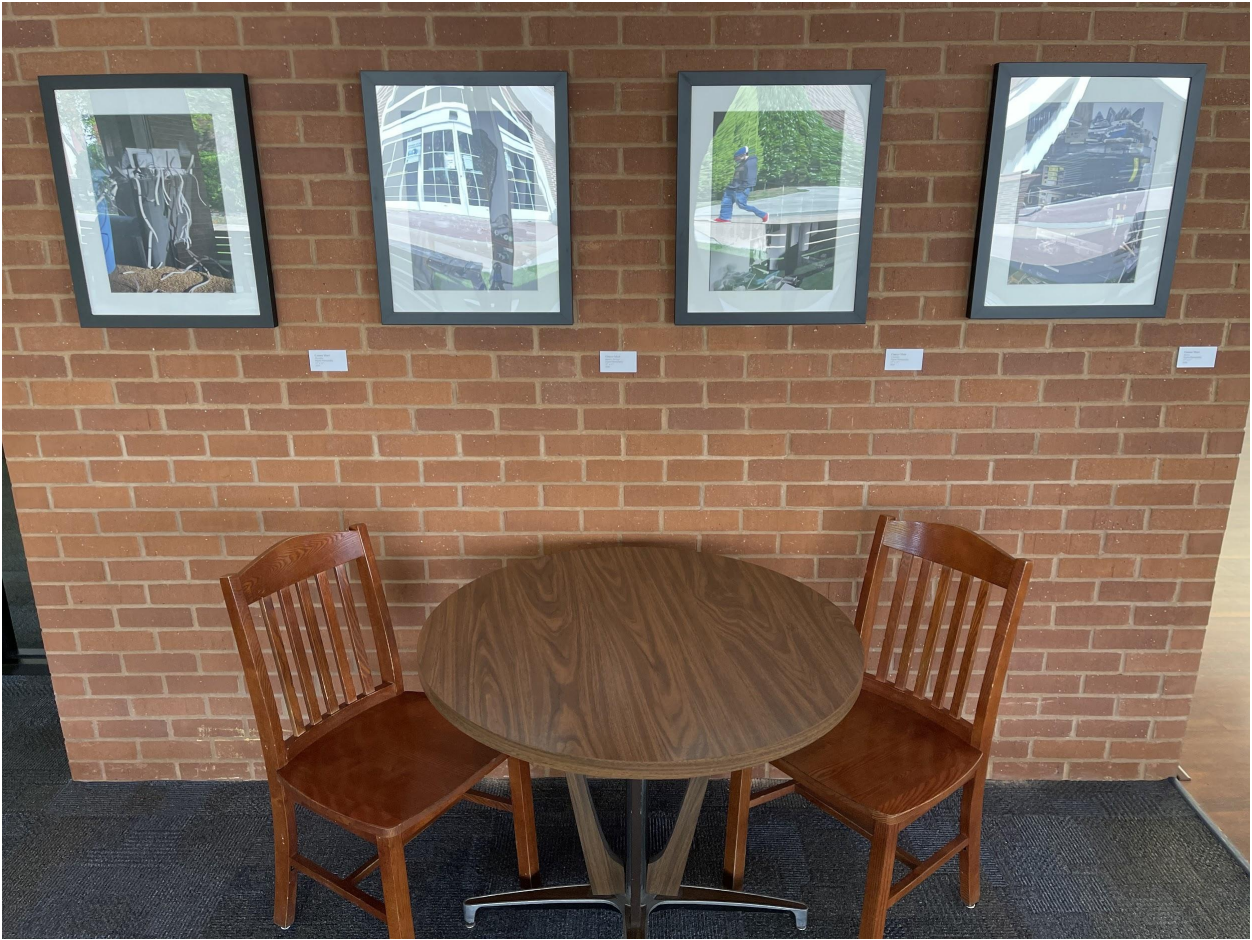
Exhibition Install Photo