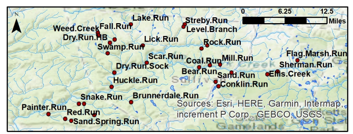
Figure 1. Sample site locations in the Loyalsock Creek Watershed.

The body condition of an animal is an indicator of their health based on their size and weight. Assessing body condition is useful for evaluating individuals and ecological disturbances. There are several methods to measure the condition of fishes from different species, regions, and sizes, such as Fulton's condition factor and relative weight equations. These equations were used to predict the condition of brook trout populations in the Loyalsock Creek watershed after Tropical Storm Lee on September 7-8, 2011. Following Hurricane Irene, Tropical Storm Lee caused historic damage to north-central Pennsylvania. The heavy rainfall saturated the soil in the watershed and triggered a catastrophic flood. Floods can severely harm freshwater habitats and disrupt fish populations. Assessing the health of these individuals before and after this event revealed how the brook trout populations responded and recovered from the flood.