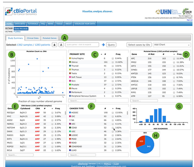
FIGURE 2 The cBioPortal dashboard for cohort-level data. (Item A) Options for reviewing the data include “Summary Overview, Clinical Data,” which provides access to individual samples and “Mutated Genes,” which records the genes mutated within the overall OCTANE cohort. (Item B) Graphical overview of the number of mutations compared with the fraction of the copy number–altered genome. (Item C) The primary cancer site. (D) The genes mutated and the frequency with which a gene is mutated. (Item E) Genes with copy-number alterations. (Item F) The histologic subtype of the cancer. (Item G) The distribution of age at diagnosis. (Item H) The sex of the enrolled patients. Other options for graphical representation are also available.

Each laboratory uses NGS panels relevant to their site and to the NGS platform available. Two panels are used at PMCC: