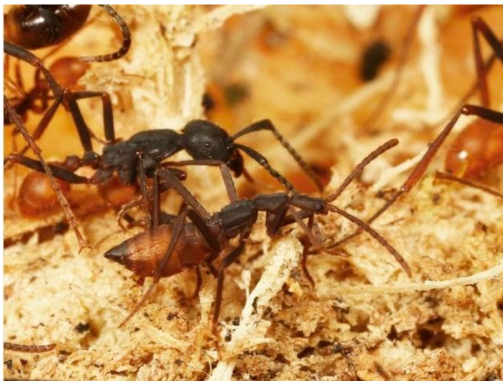
Figure 3. The rove beetle Ecitophya simulans (family Staphylinidae) moderately mimics of Eciton burchellii media workers and is considered a hunting guest. Photo of Ecitophya simulans next to an Eciton burchellii foreli media worker.