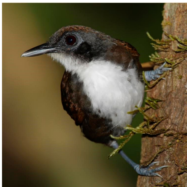
Figure 2. The Bicolored Antbird ( Gymnophithys leucaspis , family Thamnophilidae) is an obligate army ant follower of Eciton burchellii colonies. Birds of this species are found at high frequencies at swarms and bivouac sites. Photo taken at Parque Nacional Darién, Panama (Matt Deres at English Wikipedia, CC BY 3.0).

Antbirds are more commonly found with epigeal diurnal swarm raid-forming army ants such as E. burchellii and Labidus praedator [68,69]. Although other Eciton species characterised by having column raids, straggling swarm or semi-nocturnal habits might not be important resources for diurnal ant-following birds, reports indicate that antbirds can also be found associated with column-raid army ants when the raids are spread [72]. Antbirds are also occasionally reported with straggling swarms such as those of E. rapax [73] and the mainly nocturnal species E. mexicanum [72] and E. vagans [74]. Screech owls ( Otus spp.) have also been reported to follow nocturnal raiding army ants in some instances [68].