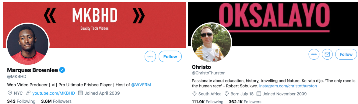
Figure 1. Examples of Twitter Influencers

who came to a substantial agreement of Cohen’s kappa = 0.724, signalling a sufficient level of inter-coder reliability (Landis and Koch, 1977).