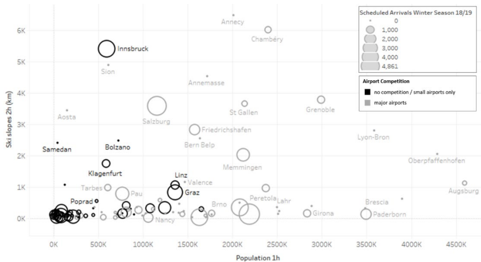
Figure 2. Accessibility, catchment area, competition, and traffic indicators for the sample airports

desirable conditions for small airports to develop scheduled winter traffic may exist. Most Austrian airports in the sample seem to benefit from these conditions: Innsbruck, Klagenfurt, Graz and Linz all have catchment areas between 500 thousand and 1.5 million residents, above-average accessibility to the resorts and little-to-no competition from major airports.