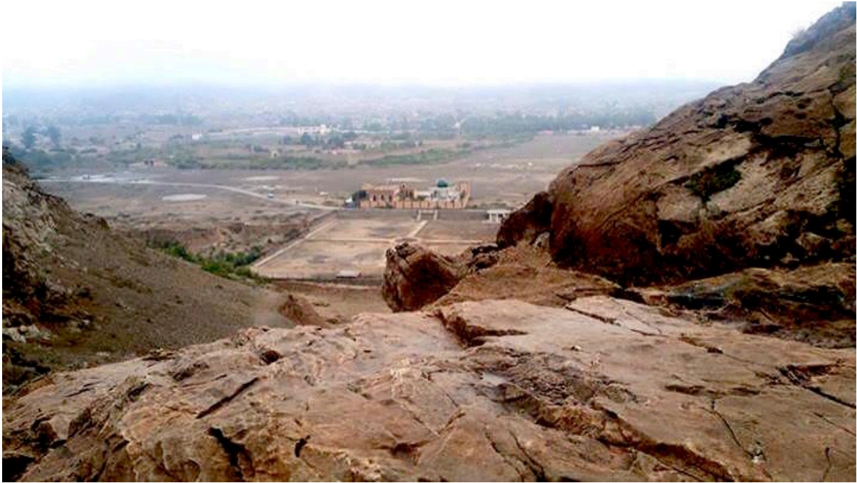
Mazar of Amir Hamza Shinwari and the borderland horizon