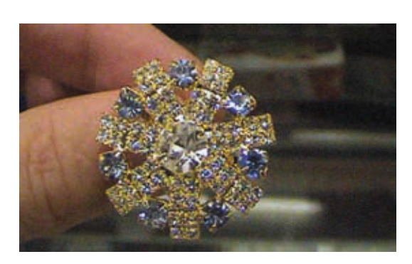
Fig 10: Cocktail ring

Although a wedding proper calls for real gold (or even fake gold), costume jewellery is also often worn to maximise the impact of glitter and colour. Such pieces are typical at pre-wedding henna nights, post-wedding dinners, and even at weddings (as a supplement to real jewellery). Mostly younger women (teenagers and newly-weds) use such fake rhinestone pieces for extra embellishment, typically alongside high style salwaar kameez sets, or high fashion embellished saris, Here's a cocktail ring.