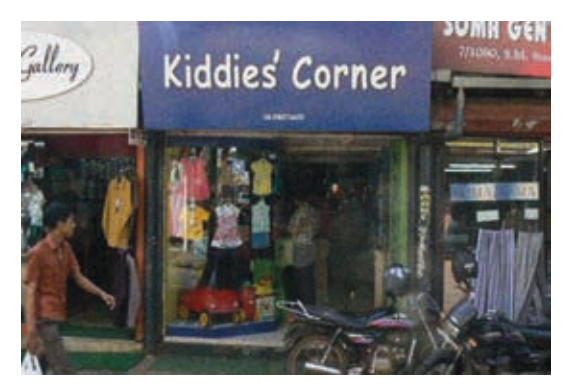
Fig 13a: Typical Calicut clothing shop

This was an entry in a henna hand painting competition run by an NGO in the Muslim area, and shows what Calicut Muslim women believe to be a more 'Arab' style, in that it uses heavy lines rather than lighter cross-hatching, completely covers the fingertips, and avoids any figurative motifs (flowers, hearts) in favour of strictly geometric patterning.