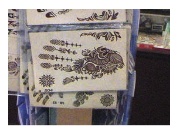
Fig 2b: Henna stencils available in stores, coming in from Bombay

In this design, there are some aspects which women claim as 'Arabic style': large blocks form strong contrast with empty space; the fingertips are heavily covered. There are also aspects which women associate more with Hinduised styles of henna: heart and flower motifs; fine cross-hatching.