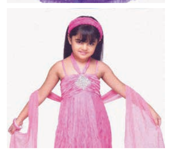
Fig 13c: Girl's ready-made party wear

In Calicut, this kind of outfit is understood as a kind of ethnicised 'dressing up'; it is named as a frock and is associated by Muslims with Christian community dress styles.