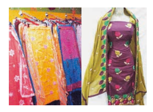
Fig 11: Salwar set

Fabric pieces arrive ready to be sewn according to individual specific requirements. Muslim women prefer long, loose, fully lined and long sleeved. This can call for highly creative and skilled tailoring given that the fabric 'sets' are generally produced with the Hindu majority community dress code in mind – short sleeves, and body-fitting.