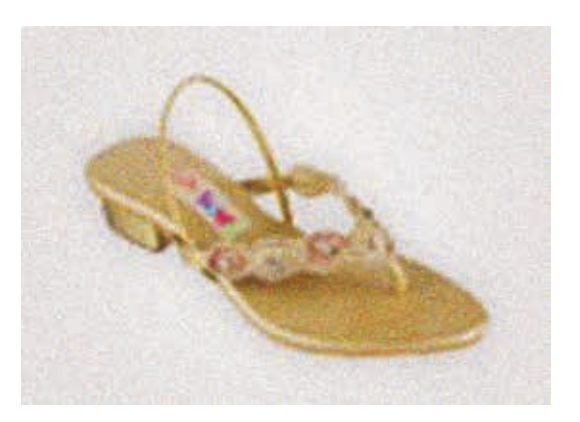
Fig 4: Girls' shoes

While these shoes are 'party wear', even everyday footwear is often highly embellished and glamorous. Women follow fashions here too, as wedges give way to kitten heels, to stilettos, and so on.