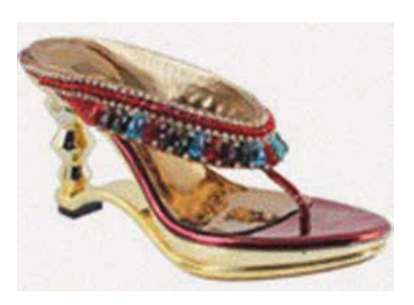
Fig 3: 'Women's shoes

community outsiders – and may own three or four pairs of glamorous, glittery or shiny high-heeled shoes. Shoes, of course, like henna and bangles, are a permissible adornment, drawing the eye towards the body's peripheries and away from the modestly concealed central area. High-heeled shoes are especially interesting in that they offer an acoustic announcement of the feminine, an amplification of feminine presence. As work on the anthropology of the senses teaches, the dominance of the visual in the modern western is specific, and other senses may be equally important (Howes 1991). South Indian Hindu women commonly wear anklets, and the jingling they produce is both marked as a highly significant 'sound of femininity' and is also eroticised (as commonly depicted in films and songs). Reformist Muslim women often eschew anklets, but their high heels are essentially fulfilling a similar function.