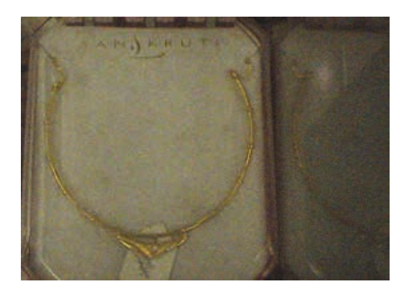
Fig 5: Fake, 22 ct covered 'rolled gold' or 'one gram gold'

borrow to increase the effect. Those who feel a bit 'gold poor' might risk bulking up with one or two pieces of 22ct covered fake 'one gram gold' (see Varsha website and FIG 5).