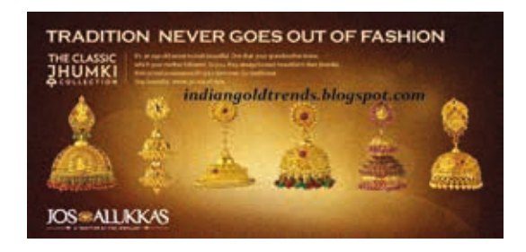
Fig 7: Earrings

A 'bridal set' comprises heavy and immensely costly pieces — even weighing up to half a kilogram —only a bride would wear adornment such as this.