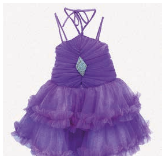
Fig 13b: Girl's ready-made party wear

This was an entry in a henna hand painting competition run by an NGO in the Muslim area, and shows what Calicut Muslim women believe to be a more 'Arab' style, in that it uses heavy lines rather than lighter cross-hatching, completely covers the fingertips, and avoids any figurative motifs (flowers, hearts) in favour of strictly geometric patterning.