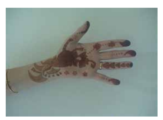
Fig 2a: Hybrid style henna

This was an entry in a henna hand painting competition run by an NGO in the Muslim area, and shows what Calicut Muslim women believe to be a more 'Arab' style, in that it uses heavy lines rather than lighter cross-hatching, completely covers the fingertips, and avoids any figurative motifs (flowers, hearts) in favour of strictly geometric patterning.