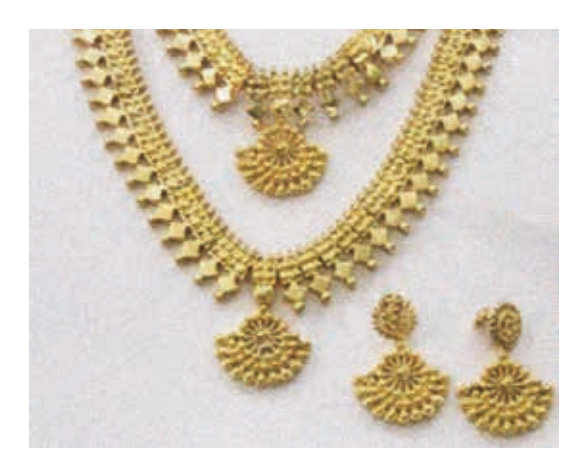
Fig 8: Bridal 'set'

A 'bridal set' comprises heavy and immensely costly pieces — even weighing up to half a kilogram —only a bride would wear adornment such as this.