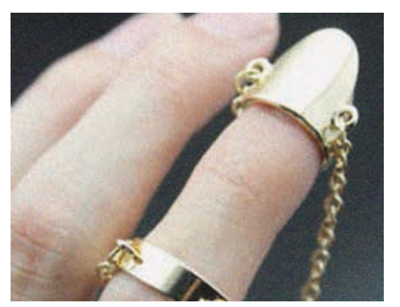
Fig 9: Gold fingernail or belt

Novelty items designed to allow more gold to be worn on the body, and to be talking points and thereby bring prestige.