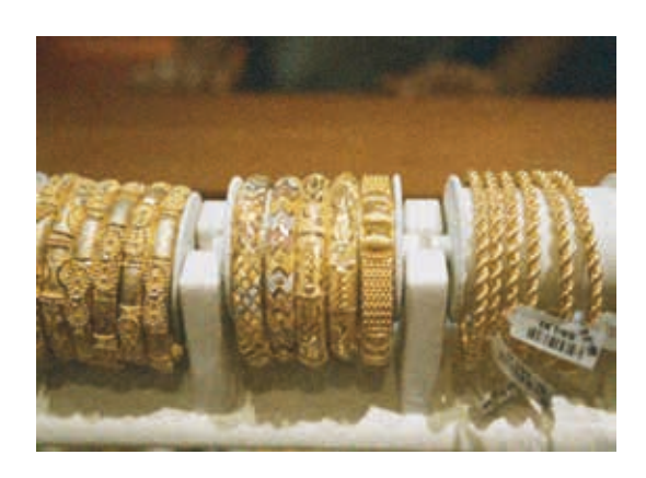
Fig 6: Bangles

There are classic pieces like bangles, which all women own at least a couple of.