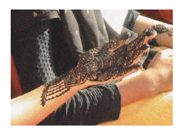
Fig 1: 'Araby' style henna

This was an entry in a henna hand painting competition run by an NGO in the Muslim area, and shows what Calicut Muslim women believe to be a more 'Arab' style, in that it uses heavy lines rather than lighter cross-hatching, completely covers the fingertips, and avoids any figurative motifs (flowers, hearts) in favour of strictly geometric patterning.