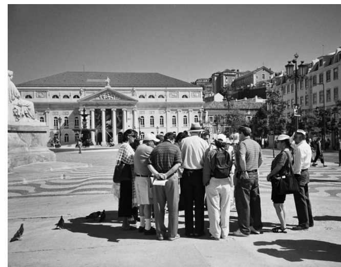
Figure 3. Saying a prayer for the Inquisition dead, Lisbon, Portugal

Do you ever wonder if the spirits of those who died burnt ... ever visit and stay with us? Perhaps on those days, when we prayed in Hebrew in their memory, perhaps they visited. Perhaps their souls were there. With us in harmony under the Portuguese beautiful blue skies. They were there to give us strength. They were there to tell us they are happy to be remembered after all these centuries.... Their descendants are coming back, finding out, returning. It was that trip that allowed us to come home.