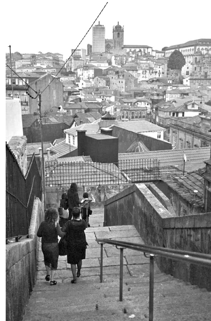
Figure 1. Touring the Escadas da Esnoga (Synagogue Steps), Porto, Portugal

Simply moving through a space to which one has an ancestral connection can provide a similar sensation (cf. Ebron 1999:920-23). A walking tour of the former site of Porto's judiaria , or medieval Jewish quarter, is a mainstay of the several Portuguese Jewish "roots" tours in which I have participated. Although there are few external signs that it was once a Jewish neighborhood, the quarter has mostly retained an ancient feel, with steep staircases through narrow, dark cobblestone alleys and high stone walls. By appearance, it is indistinguishable from other parts of Porto's old center. Tour guides accordingly stress the importance of imagining what time has erased: "There was once a synagogue here; down there was the cemetery..." On one such tour, as the guide led us down a long staircase still known as the Escadas da Esnoga (the synagogue steps), three participants paused on the landing (Figure 1). In a hushed voice, one said to the others, "You know, we are really, really walking in the footsteps of our ancestors now." She repeated: "We're really walking in the footsteps of our ancestors. And if you close your eyes, you can hear them and see them. They're still here." After a moment, one of her companions remarked wonderingly, "It's a time capsule." Said the third: "We're walking through the ages."