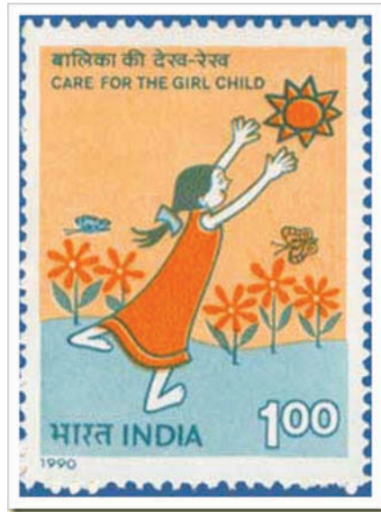
Figure 1. Indian postal stamp commemorating the decade of the 'girl child'.

The 1995 Women's conference at Beijing and the 1994 Population and Development conference contributed to setting the stage for India to adapt its growth-oriented, neo-liberal development discourse of that time to the emerging global consensus on gender inequality. The sex ratio became a strategic measure for identifying gender inequalities globally, as well as comparatively from different national data sets. As such, the sex ratio became a tool for agencies in shaping international discourses on gender inequalities through evidence-based demographic data highlighting gaps in the gender constitution of populations (Table 1).