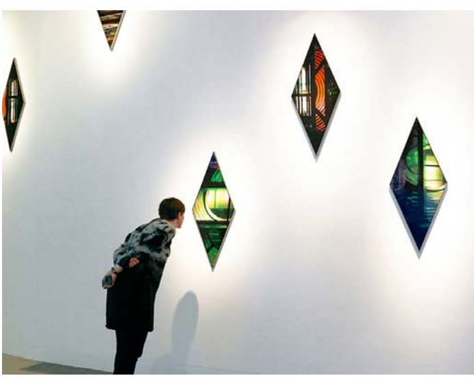
Installation shot, work by Steffi Klenz

Steffi Klenz's unusual images, specially made for the show, are based on the rhythmic and repeating pulse of the light signal of a lighthouse, and include a sound work made in collaboration with Neil Codling of the alternative rock group Suede.