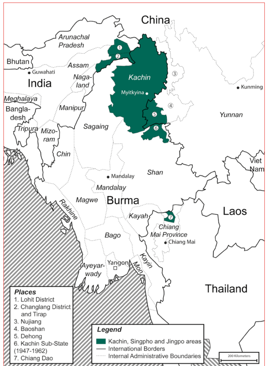
Map showing the position of the Kachin State in Burma. The shaded areas in India, China and Thailand, together with the Kachin State, are the ‘borderworlds’ where Kachin and related minority groups live.

My own work in Burma – which has been supported by the British Academy through a Postdoctoral Fellowship, and most recently by the publication of a monograph in the related series – has always been slightly at a tangent to the mainstream. It has been concerned principally not with the dominant Burmano-Buddhist narrative of the country’s national history, but rather with the production of ethno-nationalist ideologies and conflict in the country’s borderworlds. Most specifically, I have been working for many years on issues relating to the Kachin region of the country and associated areas in north-east India and Yunnan in China. This is a complex, challenging environment in which to work, and I am deeply grateful to the British Academy, which gave me ‘the iron rice bowl’ of support as a Postdoctoral Fellow, for enabling me to push the boundaries of my