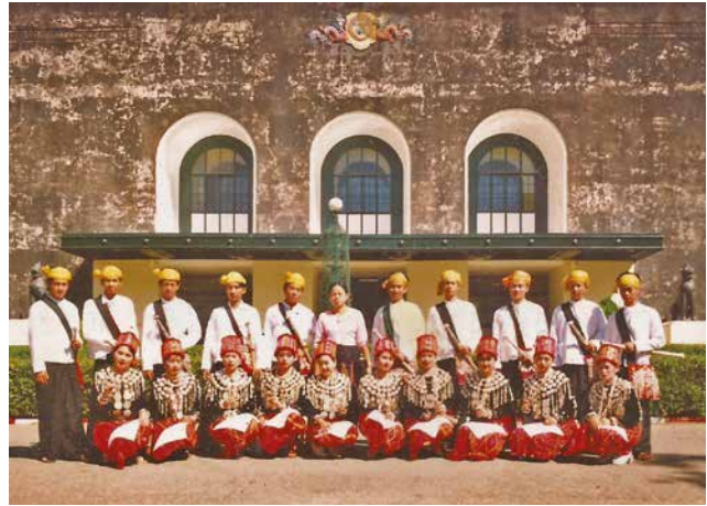
A group of Kachin students outside Yangon University, where they performed 'traditional' dances during the university's Diamond Jubilee Celebrations in 1995. At this time, the university was open briefly and students were being rushed through their degrees. Throughout the 1990s, the university was repeatedly closed because of student protests. The early Rangoon (later Yangon) University student leadership of the KIA/KIO also promoted cultural activities of this kind to consolidate a sense of political and cultural identity among Kachin students.

The Burmese school and higher education systems were often formative social experiences for many of those who mobilised and organised the first armed opposition movements in the Kachin region. A group known as the Seven Stars, who went on to help found