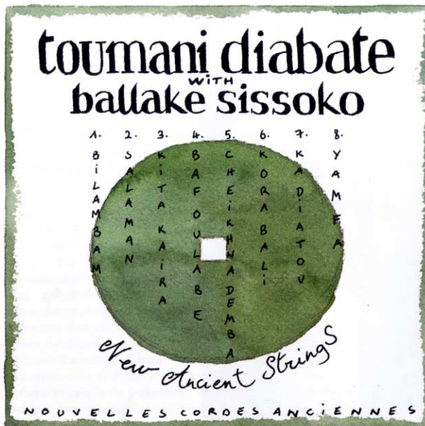
Figure 2 Album cover for New Ancient Strings (Diabaté and Sissoko 1998).

album has also had an impact in Mali itself, raising the profile of the kora . For example, Mali's President, Amadou Toumani Touré, presents important guests and visiting heads of state with a miniature kora —and a copy of New Ancient Strings (see Figure 2). Like the parent LP, one of the tracks of this album, 'Cheikhna Demba', has