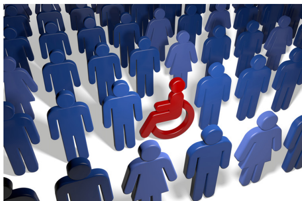
The UK system is a mess Robert Kneshke

Universal Credit has been criticised for introducing new and punitive levels of sanctions – for example over 100 claimants a day with mental-health problems are sanctioned for failing to attend appointment, which means they lose access to income without their prospects of accessing work improving in any way. This stigmatises disabled people, damages their health and undermines social cohesion. It can also end up costing the government more.