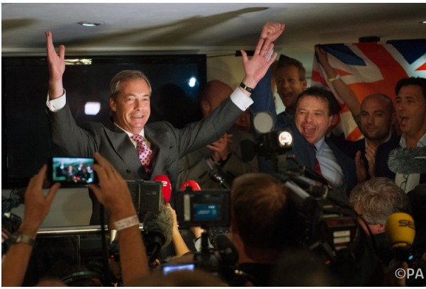
Time for the Brexiters to deliver.