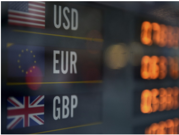
Markets are down.