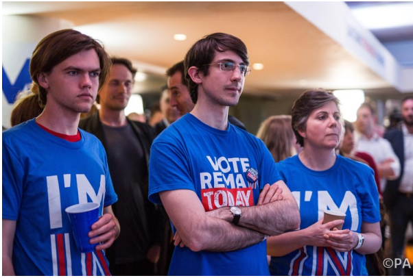
The news sinks in for Remain campaigners.

something that potential immigrants might want to consider.