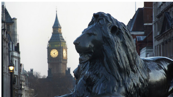
London. Taking the lion's share.

There are a number of potential reasons for this. For example, the majority of platforms are located in London and we have found that word-of-mouth referrals through business networks are still very important in both identifying and accessing crowdfunding platforms. Many businesses also want to speak to platforms "in person" before committing to a campaign (rather than engaging virtually), and so being within visiting distance of a platform is important. So despite the internet-mediated nature of crowdfunding, where distance should be irrelevant, it is strongly concentrated in the London and the south-east ecosystem. We are currently exploring this trend further.