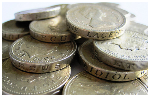
Cash hunters.

During 2015, we undertook the largest in-depth study to date, examining equity crowdfunding in the UK, interviewing over 60 British start-ups to get their views of why firms use equity crowdfunding, how the process works and the benefits it brings to firms.