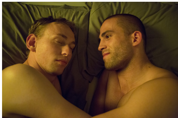
Sex on screen.

Even the “straight” characters defy normative gender and sexual expectations. There’s the time, for instance, when Henry’s sister Cleo (played by the ever-fabulous Julie Hesmondhalgh – who is perhaps best known for playing trans character Hayley in Coronation Street) enlists a male friend for sex and provides a detailed description of how she wants to try her “new vagina” that she hasn’t “used” since a post-birth operation going not quite as planned.