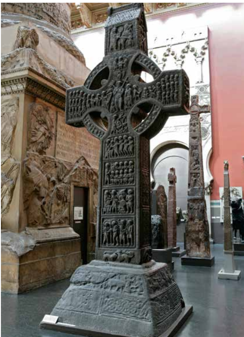
Plaster cast of the Nigg Pictish cross-slab in the V&A's Cast Court. Its diverse collection includes a few examples of early medieval sculptures from Britain and Ireland

The collections of plaster casts and other replicas that provincial museums acquired and displayed are the product of an environment in which they were encouraged to acquire copies of things — reproduced originals, rather than authentic originals — and in which, in their own words, the 'benighted country curator' benefited from the advice of 'cultured experts', people who delivered imperial objectives determined by those working for what Henry Cole, the founder of the V&A, described as the 'central storehouse or treasury of Science and Art for the use of the whole