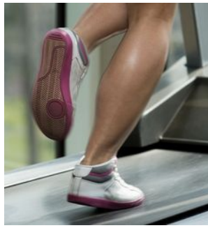
Breaking tread! Jasminko Ibrakovic

fitness and strength. Aerobic fitness can be assessed with the dreaded VO 2 max test, which involves exercising to your physical limit on a treadmill or stationary bike. This gives a good indication of the functional capacity of an individual's cardio-respiratory system.