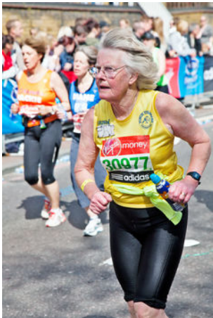
Gran master i4lcocl2

The physical frailty associated with ageing is primarily due to reduced aerobic capacity and physical strength. After the age of 25, inactive individuals lose their aerobic capacity at a rate of approximately 1%/year. They lose muscle mass at a rate of approximately 0.6%/year after the age of around 30 (30% decrease from age 30 to 80).