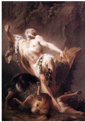
Milo, original muscle man

Thanks to these insights, in modern-day bodybuilding we now have a very good idea of how to improve muscle mass and strength. Muscle growth with progressive resistance exercise is a good example of how adaptable our skeletal muscle is. Part of the mechanism by which muscle grows is through a process called protein synthesis. Muscle grows by increasing the rate at which proteins are made, since muscle is made from protein.