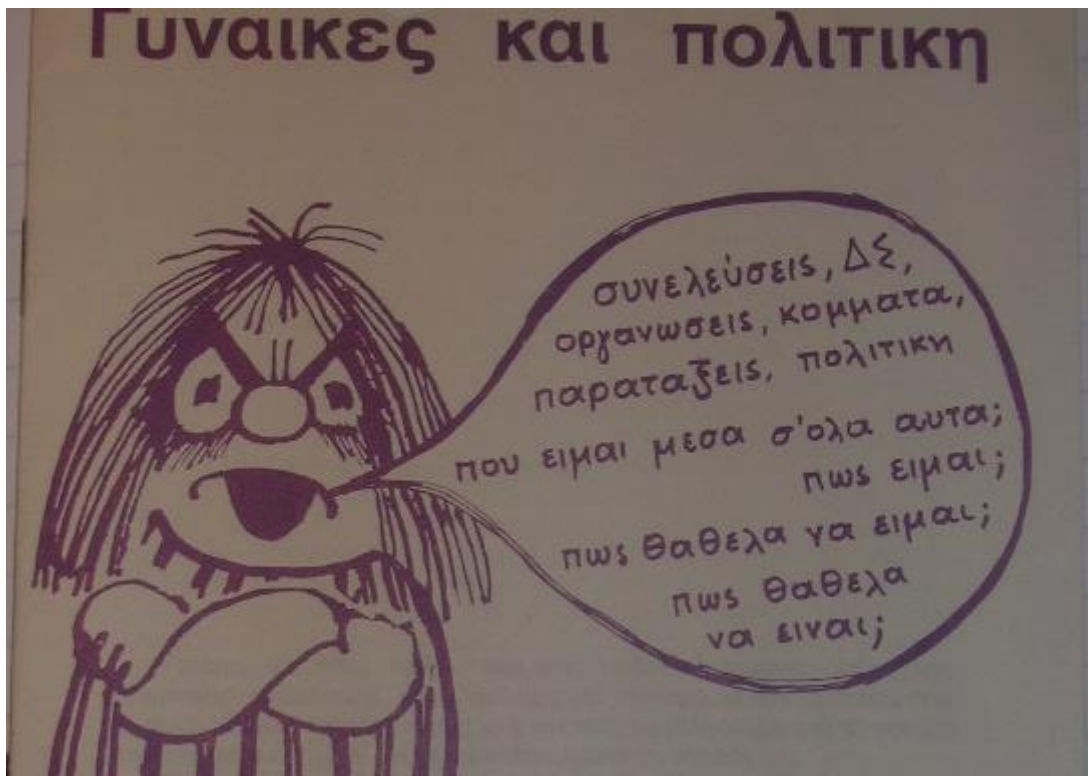
Image 1: The caption reads “assemblies, administrative councils, organisations, Parties, politics. Where and how do I position myself in relation to all these? How would I like to be? How would I like all these to be?” 119