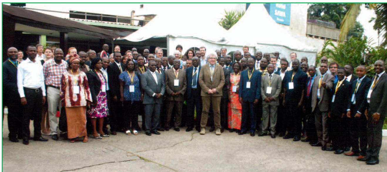
Participants at the Validation Workshop on the “2013 State of the Forest – 21-22 March 2013”

The 2013 State of the Forest Report is the fruit of a long participatory process of information gathering, exchanges between experts, debates and the building of consensus to provide elements for the improved management of the Central African ecosystems. This vital undertaking responds to a groundswell request from diverse stakeholders for consolidated information in a joint report. The process of creating the report comprises many stages, wherein many actors are involved over a period of more than two years. The production of this new edition began in March 2011 on the occasion of the closure of the workshop to validate the 2010 Report, which was attended by about 65 participants.