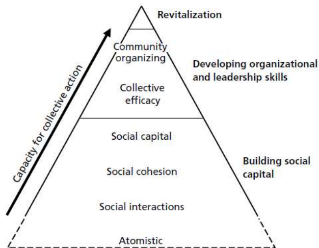
Figure 1: Hierarchy of capacities

McCarthy et al. (2004) suggest a framework for bringing these social benefits together to form a simplified theory to describe how these various ideas might relate to each other (Figure 1). Social benefits are gained at each stage, and each stage is important. Each stage must be built on the stage below it, but the challenges are likely to increase as a community works its way up the pyramid. For example, community revitalization involves collaboration across groups and issues and sustained collective action and co-operation over time.