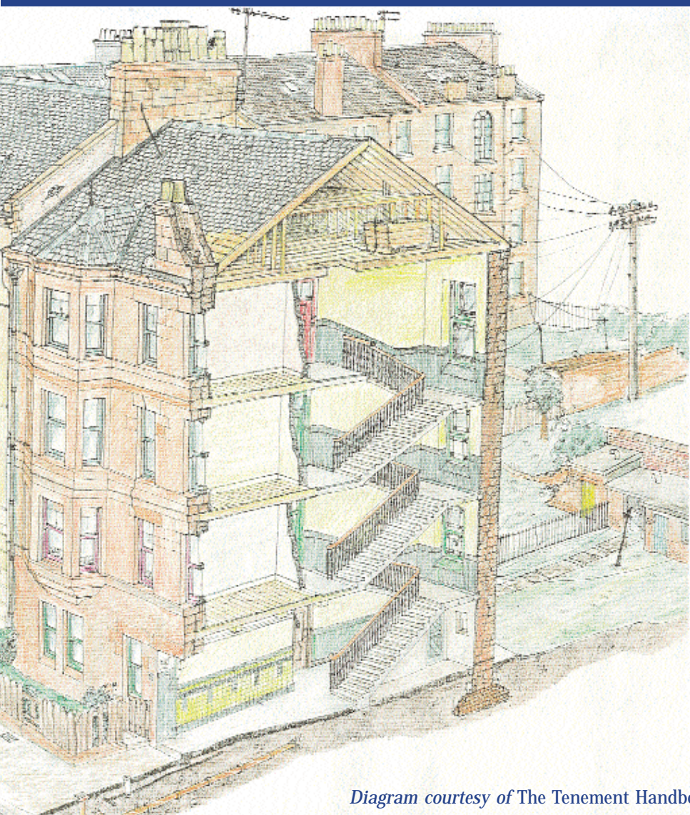
Diagram courtesy of The Tenement Handbook