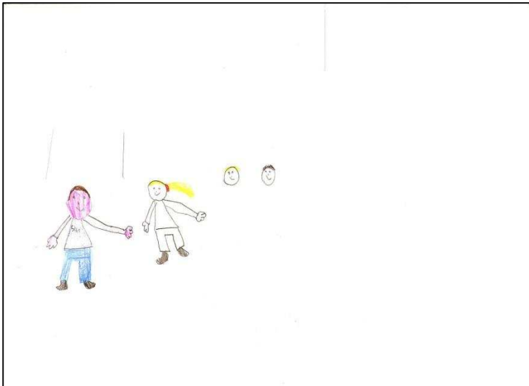
Figure 3 - The best thing...the problem...

Best: If you fall out I say I will never talk to them. I promise myself, but then I just can't stop myself. It's like a lion would eat meat. It's like nature. You're just friends again.