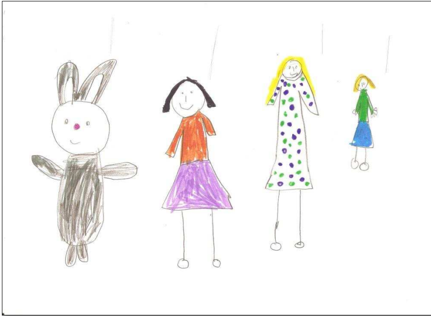
Figure 2 Tell me about your friends