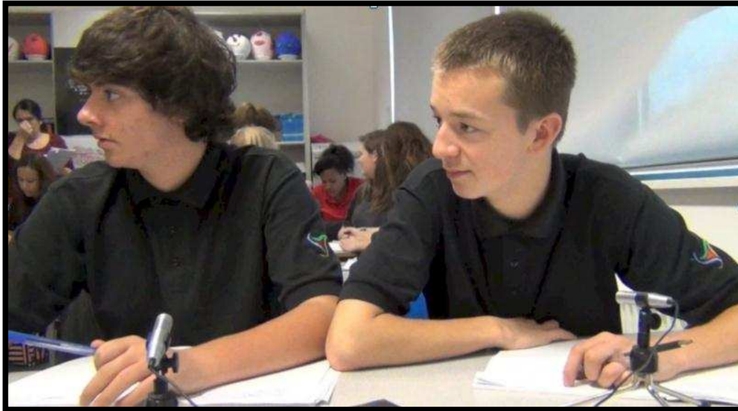
Fig 5: Postural alignment: both hands in front of bodies handling pens.