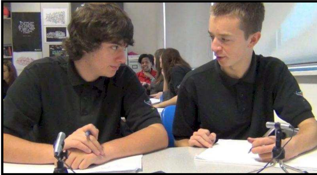
Fig 6: Locked gaze and mirrored posture with pen in hands