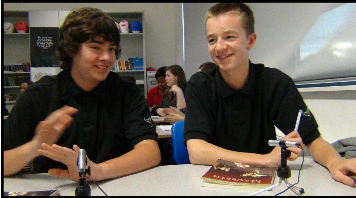
Fig 7: Appreciation.