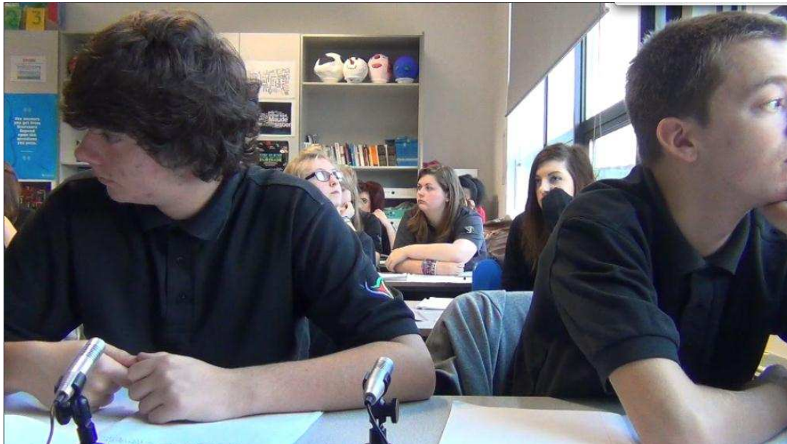
Figure 3: Not engaged.