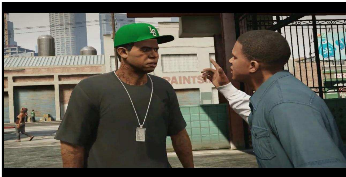
Fig 4: Franklin and Lamar (Benzies and Sarwar, 2013)

In this first example O and J discuss having Franklin and Lamar, two petty criminals from the video game, Grand Theft Auto 5, (Benzies and Sarwar, 2013) as their main protagonists, in place of Macbeth and Lady Macbeth. This is an example of the boys bringing familiar characters from their out of school social worlds into their classroom discourse. Maybin (2012:385) discusses the way indexicality, the references made to specific times, places or people, can be performative.