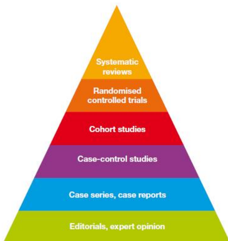
Figure 1: Evidence Hierarchy System

The lack of quality research in arts therapy studies is not an unusual situation, and is similar to the situation that most medical research was in a decade or two ago. There are now evidence hierarchy systems which classify research by study design and Figure 1 shows the evidence hierarchy most commonly applied to medical research.