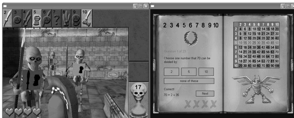
Figure 2: The extrinsic version of Zombie Division

In this way the intrinsic version of the game had a tight coupling between the gameplay and learning content where mathematical division was fundamental to the game's combat mechanic. The extrinsic version was exactly the same game but with the mathematical relationship removed from the combat mechanic. It then included identical mathematical content in the form of multiple choice questions at the end of each level (see figure 2). Both the intrinsic and extrinsic groups had access to the mathematical representation during the appropriate aspects of their respective games. The control version was the same as the extrinsic version without the multiple choice questions (i.e. no mathematical content at all).