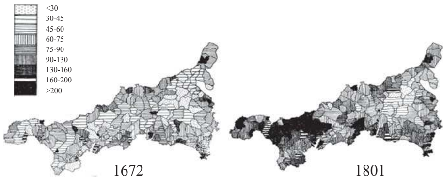
Fig 1: Population per \text{mi}^2 in Cornwall 1672 and 1801 (Pounds 1943: 38–39)

Regarding causes for decline, most authors highlight clerical imposition of English since the 16th century, and the demographic destruction wrought by various wars and uprisings (e.g., Ellis 1974: 52–69). A neglected factor (less exciting but probably more important) is long-term 16th–19th century migration from the largely non-Cornish-speaking east of Cornwall to the language’s last footholds in the west – fuelled mainly by a mining boom. As one geographical account puts it, the terminal decline of Cornish in the early 18th century “is almost certainly to be attributed to the influx ... not only from East Cornwall ... but also from beyond” (Pounds 1943: 45).