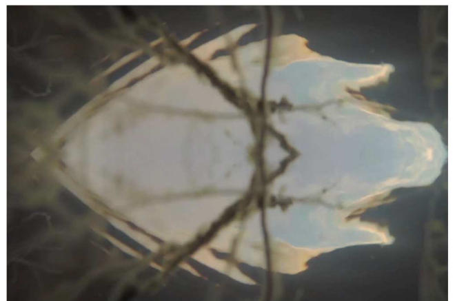
Belper 2014 1