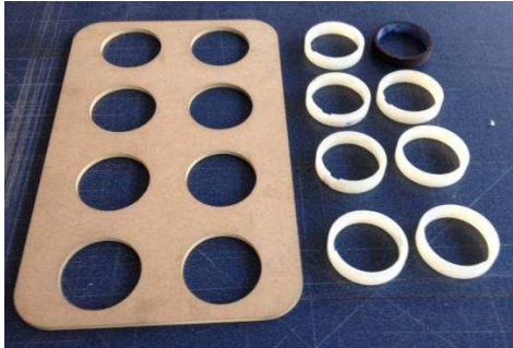
FIGURE 1 SPHERICAL SUBTEST SETUP

A second wooden board is used for the 113mm subtest. The dimensions of the board are 440mm x 365mm, and 15mm deep. The board has 6 holes. Each of the holes measures 15mm in depth and 113mm in diameter. Holes are separated from each other by 44mm in 2 rows of 3. The Extended Spherical subtest uses 6 circular-shaped plastic objects. The objects are 112mm in diameter (Figure 2-C).