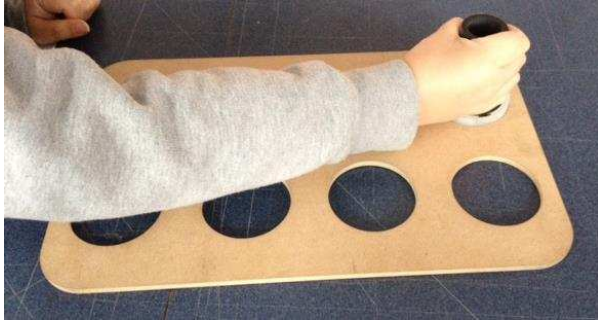
FIGURE 3 PARTICIPANT PERFORMING THE VDT-CYLINDER SUBTEST

The following verbal instructions should be provided to the participant: "Please start with your dominant hand. Start by picking up the object at the top [point to object] and place it in the hole at top opposite side of the board, pick and place all the objects as quickly as possible, finishing with the object at the bottom of the line. If you drop an object, time is stopped, and a 5-second penalty is added. Continue to pick and place the objects with the object that you just dropped. The clock starts where it was stopped, and the time is continued."