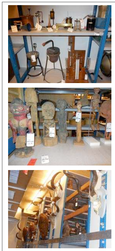
Figure 1. Images of MUSEON deposits show examples of the extended and eclectic collection.

engage the visitors in other ways than simply as receivers of information and appeal to the sensorial aspects of visiting a museum [3]; [5] set up an interactive home-like study where visitors can explore possible stories of unknown museum objects and leave their interpretations; [2] invites visitors to take physical objects from one place to another within an open air museum and use this as a mechanism to reveal content and invite group discussion; 0 reveals the under-layers of a painting only if multiple visitors stand in front of it, fostering a form of collaboration among strangers; [6] provokes visitors to look at and act around sculptures in a sculpture garden.