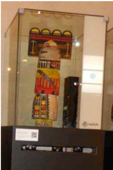
Figure 6. A close up of a case. The tower hosts the projector and the NFC reader/card-pocket; the slit shows the proximity sensors.

possible uses within their own museums. They appreciated the fresh and novel approach that attempts to take the exhibits closer to the visitors by talking directly to them (via the object's life) as opposed to the standard museum label. The idea of exhibits with personality was particularly well received by curators of challenging collections, such as human remains from the same place but from different ages and different social settings. In this case the first person speech and the characterisation would work very well to bring the story of those people from different times and different social classes alive for the visitors to enjoy.