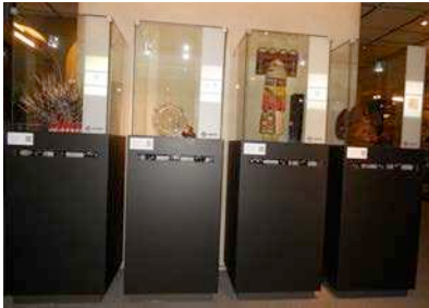
Figure 5. The four cases as installed in MUSEON.