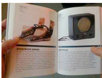
Figure 3. The extended catalogue of objects stored in MUSEON's deposits. The Chinese shoes and the Nazi radio were both used.

visitors would not know of the competition unless they have read the poster or a flyer; we considered the natural behaviour of visitors to be enough at this stage.