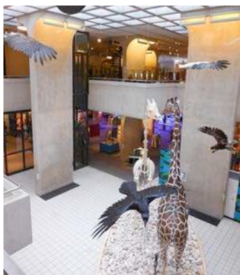
Figure 2. MUSEON exhibition floors. The picture is taken from the landing on the first floor (permanent collection). The cases are across the hall against the pillar.