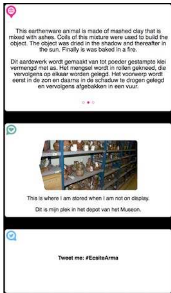
Figure 7. An example of the content projected on the case front glass.

exploration of Twitter on the exhibit floor brings disappointing results. Very few tweets were sent to the cases. We are inclined to believe this is due to the cases being in an unsuitable position (not a high-traffic area) and at an ill time in the visit: sending a tweet would require visitors to take their phone out and so, actually, would interrupt the visit. We speculate that a positioning where there is high traffic and people are killing time, such as the museum cafe or the entrance hall, could give much better results. The experts in MUSEON are also convinced the cases could be an excellent way to attract interest to the museum if they are placed in a different location, such as a station or the city hall. This last option is currently being explored for some of the objects in the deposits for which there is more than one exemplar and are less fragile. We can speculate that in that very different context the humorous aspect of the interaction and the potential high contribution of other viewers could make the cases provocative and memorable.