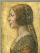
Figure 1: La Bella Principessa. Leonardo da Vinci (late 15th Century). Figure 1: La Bella Principessa. Leonardo da Vinci (late 15th Century).

In 1998, a little known picture catalogued as a 19th century imitation of an Italian Renaissance prototype by an unnamed German Romantic artist was sold for a modest sum in a New York gallery. Later, it was sold to a buyer who suspected that the picture's origin was much more prestigious than originally thought. Following subsequent examination by experts and extensive research by the Oxford art historian Martin Kemp, the portrait (Figure 1) was held to be a once in a lifetime discovery and it was attributed to Leonardo Da Vinci (Kemp & Cotte, 2010).