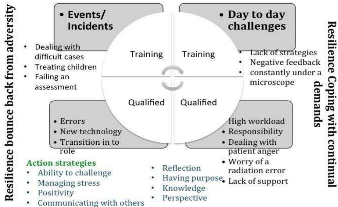
Figure 2 A proposed model of professional resilience

Across all data collection modes the clinical placement experiences for students was identified as an area where resilience was stretched but also developed. As the clinical placement experience has been identified in the UK as an area potentially of critical importance to student attrition rates(8) it is an area that needs future focus. Educators and placement staff alike need to look at the placement experience and look at ways of enhancing resilient strategies prior to the student's first clinical placement and then on-going support to enhance resilience as experiences develop throughout the course in preparation for professional life; we have listed in the section below what educational curricula may require for this purpose. This is supported by evidence in the literature as reported in the review by McAllister and McKinnon(24). However, while much work can be undertaken in preparing the students to be more resilient it is also important that individual departments or individual practitioners acknowledge the impact they can have on a student's ability to be resilient. For example, there were a number of occasions throughout the study that referenced how comments from staff 'shattered' confidence, or how individuals felt 'crushed' by comments made by staff when they were students. While McAllister and McKinnon(24) acknowledge the need for professional cultural generativity their recommendations focus on utilising resilient practitioners as positive role models or