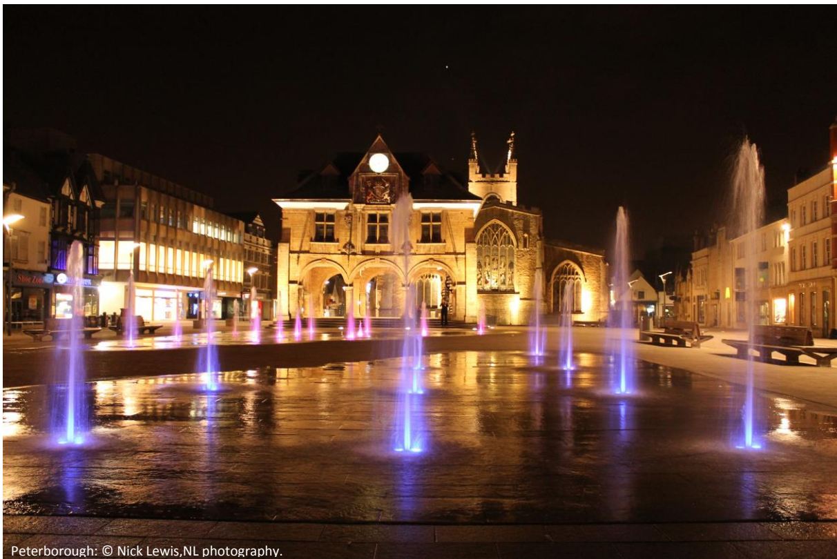
Peterborough

Peterborough DNA has a Governance Board, which includes the Council's Chief Executive and Directors and a delivery team including key council officers and a cabinet member. It contributes to the higher level Greater Cambridge and Greater Peterborough Enterprise Partnership. Peterborough City Council also have a City Leadership Forum and organised a Smart City Leadership Event in 2015 as part of Peterborough DNA, to which they invited a number of public and private sector representatives. They say they have a