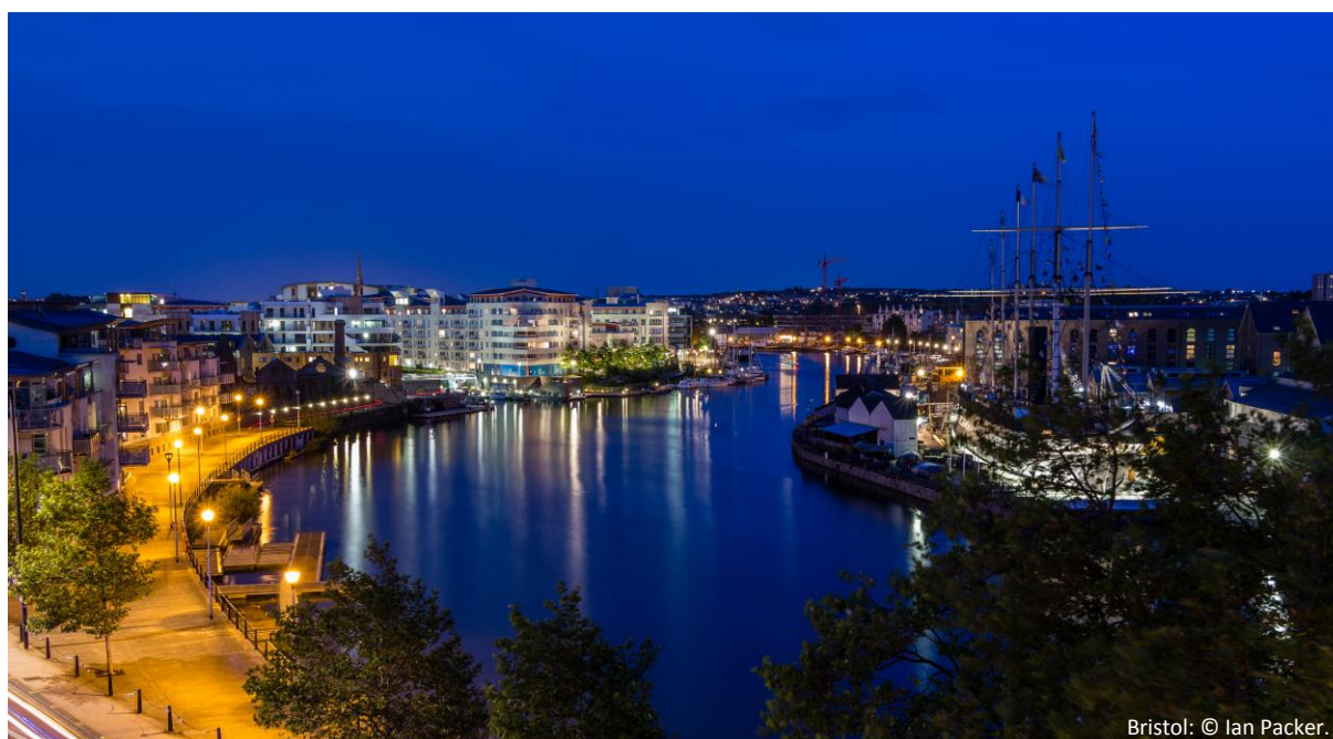
Bristol: © Ian Packer.

Their smart cities work is starting to contribute to decision-making in the city; for example, in the early years of the programme they spent a lot of time working on smart energy projects, which led the Council to