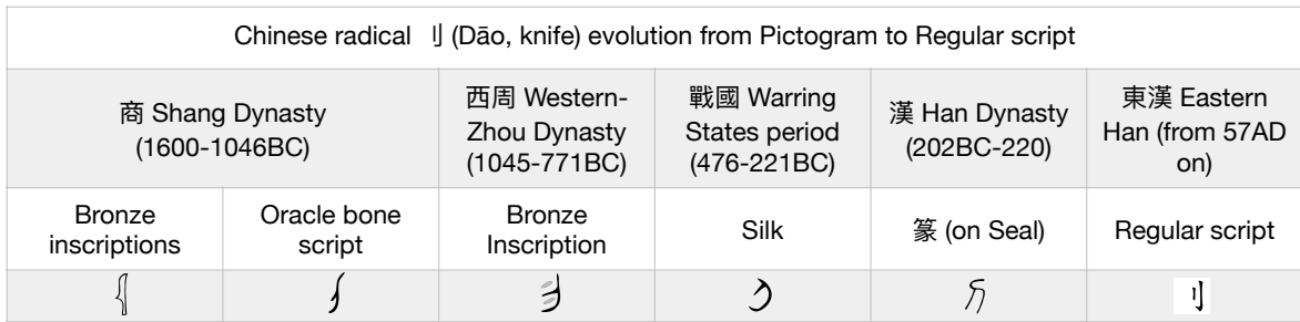
Figure 4: Example Chinese radical, 丩 (Dāo), where the character evolved from leftmost pictogram to present day regular script (rightmost) containing only two strokes. The two strokes are called as 豎 (Shù, vertical) + 豎 (Shù gōu, vertical with hook). The corresponding character representation is 刀 (Dāo).