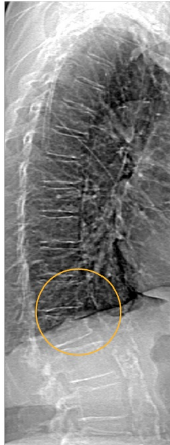
Vertebral Fracture Assessment – a critical part of a complete fracture risk assessment