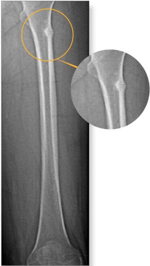
Manage Patient's concerns about Atypical Femur Fracture*