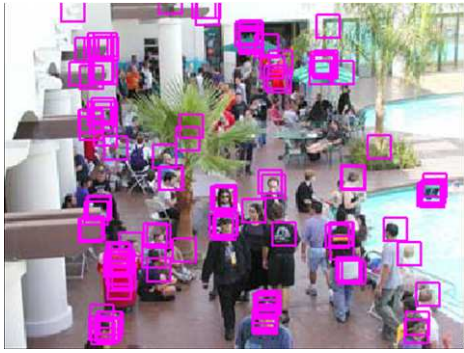
Figure 5: Total hotspots in two groups.

introduce baroque music to the PassPoints graphical password scheme considering the password memorability and complexity. With music stimulus, people not only tended to construct significantly more complicated passwords than their counterparts without music, but also performed significantly better in terms of recall success in the long-term tests. This result indicated that the background music improved the memorability of passwords in PassPoints. But in respect of login time and hotspots, there were no statistically significant differences between two groups.