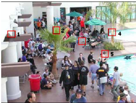
Figure 2: Passwords in PassPoints with length being 5.

memory limitations have caused lots of security problems. We bring background baroque music to the PassPoints graphical password scheme and do an investigation to check whether it can improve users' memory or induce users to set stronger passwords.