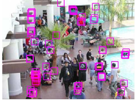
Figure 4: Hotspots in control group without music.

Hotspots are areas of the image with higher probability of being chosen by users as individual click-points. Hotspot is a serious security problem in click-based schemes. Figure 3 shows the hotspots distribution of PassPoints passwords in music group, Figure 4 shows the hotspots in control group without music, and Figure 5 shows the total hotspots in two groups. We can see similar slight clustering of click-points in both groups. It appears that background music does not work in terms of hotspots. Points with high visual salience were still more likely to be selected as passwords.