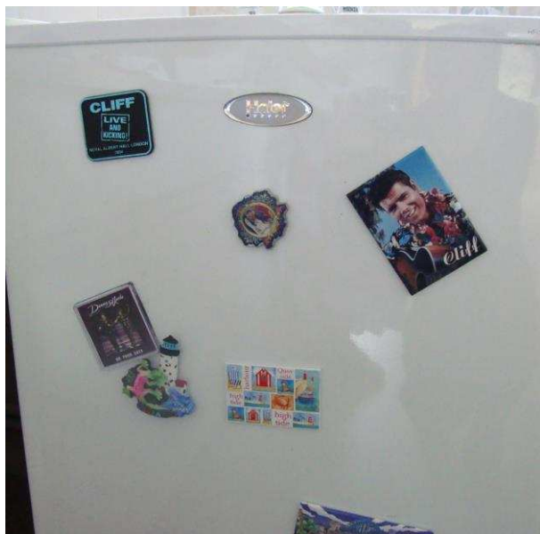
Fig 2: Peggy's fridge

father (Fig 3), illustrate the way in which 'objects mediate our interactions with other places and other times' (Brandt and Clinton, 2002, p. 345), supporting the negotiation of an acutely emotional process.