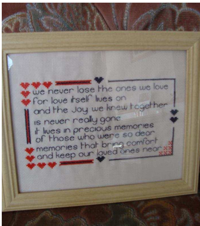
Fig 3: Cross-stitch made for Peggy by her daughter after the death of her husband