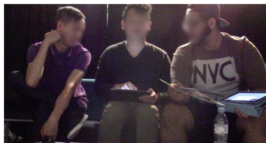
Figure 4. Participants all working together

Group I4, evolved a strategy that involved each of them working together collaboratively across the TV and the two tablets. I43 described the strategy as having developed after the start of the task, when they had no structure to their selections; he described their lack of a strategy as leading to "complete chaos". In their approach I41 controlled which videos were watched by the group on the TV, while I42 was primed to press the pause button should any of them spot Jason on the other tablet. I41 would then tap the tag button. Both group I4 and I9 were relatively successful, spotting and tagging Jason in 4 videos each, however the strategy adopted by group I9 led to two duplicated tags, whereas as all I4's tags were unique. In four out of the five groups that adopted a system of two participants working together and one working alone, duplicate tags of Jason were created.