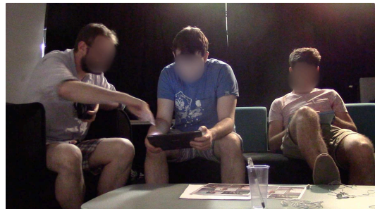
Figure 3. Participants working alone and together

Figure 3 shows a configuration of users where 2 participants work together and 1 alone, and figure 4 the whole group collaborating together.