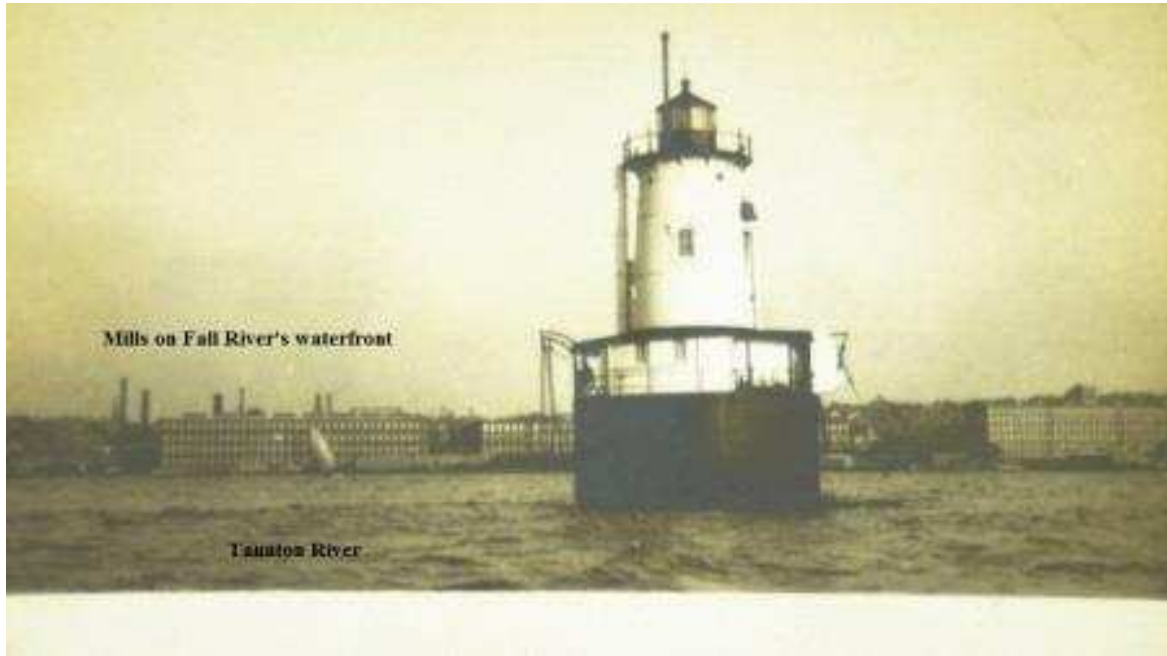
Figure 3. 'Lighthouse in Fall River Harbor', [n.d.], Keeley Library – Fall River Local Slides, < http://www.sailsinc.org > [accessed 29 September 2014]