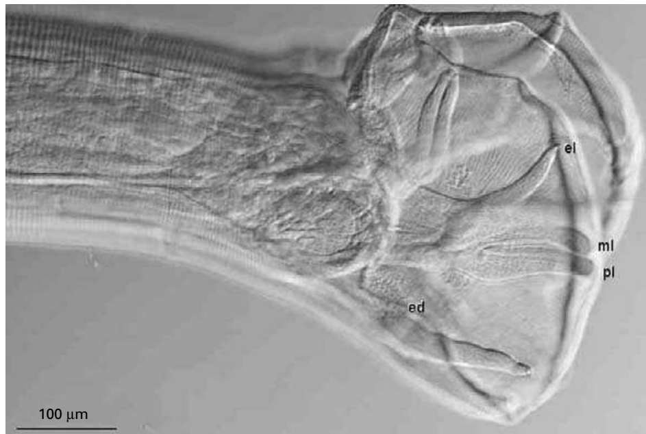
Fig. 1. Lateral view of bursa of male Ancylostoma ceylanicum Nottingham laboratory strain. Lateral rays are marked as externolateral (el), mediolateral (ml) and posteriolateral (pl), and the attachment point of the externodorsal to the dorsal trunk as (ed).

group and strong support (100%) for this OTU as a separate group lying basal to the other 4 species. Taken together, there is now strong evidence to suggest that isolate ' A. ceylanicum ' from a cat in Townsville genetically belonged to A. braziliense and that the difference between the latter and former isolates is suggestive of geographical diversity within a single OTU.