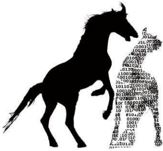
Figure 1: HABIT Project logo