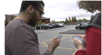
Figure 5. After the team received an instruction to disband, AW (right) and HB (left) simultaneously turn back and start walking back to the drop off zone, displaying bodily alignment.

This episode begins with an instruction ( AW, HB -> 44 ) from the agent. At that moment, there were 5 players at the drop off zone (AR, KD, LC, HB, AW). Immediately after the instruction, HB starts looking for AW in the local group. Shortly after, AR and HB team up to go for 44 as instructed. However, 13 seconds later the team is interrupted with a HQ message telling them not to go for 44 ( Target 42 and 44 is not reachable ). Four seconds later, a conflicting agent instruction was delivered, implying they disband the team ( AW, KD -> 44, HB, AR->31 ) but still pursue the target 44. At first, AW stops walking and topicalises the instruction ( AW: I got a new instruction ), followed by both teammates simultaneously turning towards each other (Fig. 5). The bodily alignment in the action suggests agreement to follow the new instruction. On their way back to drop off zone, HB and AW confirm their intentions (HB: I need to team up with AR , AW: I need to team up with KD! ). In this case, the teammates respond to the interruption by mutually agreeing to abandon the current team and task in favour of following the new assignment.