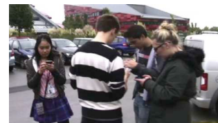
Figure 3. Players from left to right: LT, SS, CR, PC. LT walking around the team, her body orientation suggesting attempts to leave the group.

[0:00] After a target drop off, LT and SS joined PC and CR at drop off zone. [0:24] HQ sent message A: LT, if you think you have the stamina to run to 10 around the north of the lake do so now with a firefighter [0:28] Agent instruction received: NK, LT -> 16 LT: They said ((reads out aloud HQ message A)) [0:35] CR ((facing LT)): Shall we go get 10 LT: Mine is 16 [0:38] HQ sent message B: Avoid 17 at all costs (...) I'd avoid 10, too. CR: ((read out HQ message B)) avoid 10 now. [0:55] New agent instruction received: NW, LT -> 15 LT: 15! [Fig. 3] LT keeps walking and turning back and forth from others. PC and SS discuss next steps, LT does not engage in the discussion with them. [1:12] SS ((facing PC)): Shall we go get 19? ((turning towards LC and CR)) are you going to 10 or something? CR: Eh::, HQ said no. [referring to message B] [1:24] SS and PC decide to go for target 19, and leave. [1:29] NW sent message: LT where you CR ((facing LC)): Are you LT? LT: Yes. CR: NW is looking for you. LT: Yah thanks. ((turning away from CR)) Ah::: I will go towards them. ((starts walking)) CR: Okay. Do you want company? LT: ((turning back towards CR)) Yeah. CR and LT leave drop off zone together to find NW.