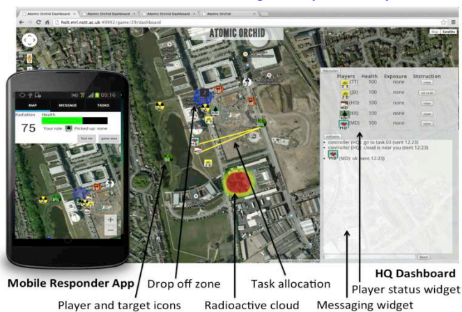
Figure 2. Team coordination interfaces.

In their mission to rescue all the targets from the disaster space, a centrally located HQ and the planning agent support the responders on the ground. In what follows, we present the player interfaces and the interactions with the planning agent. A demo video can be viewed at http://bit.ly/1ebNYty .