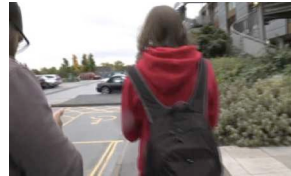
Figure 4. AW (right) leads the way, heading to target 44 as instructed.

[00:00] HB, AW at drop-off zone, new instruction received: AW, HB->44 HB: Alright, who is AW? AW: Me. HB: let's go southeast (the direction of target 44). [00:07] AW, HB looking at their screens [00:26] HB: There is no 44. AW: down there HB: Ok, yea, yea, yea (0.5), I can't see, Oh, there, yea, let's go [00:35] [Fig. 4] Team begins moving towards 44 [00: 48] HQ sent message: Target 42 and 44 is not reachable. AW: ((reads out the message)) AW and HB stopped walking. [00:52] New instructions received: AW, KD -> 44, HB, AR->31 AW: I got a new instruction. [Fig. 5] AW and HB simultaneously turn and start walking back towards the drop off zone HB: I need to team up with AR AW: I need to team up with KD! Oh, it is 44 again. [01:01] AW, HB arrived at drop off zone, met AR, KD HB: AR? KD: AW? We have got (1.0), 44, right? AW: It said 44 is not reachable, but I got it again, so, let's try. KD: Alright [01:14] AW, KD begin walking to 44, AR, HB team up as well.