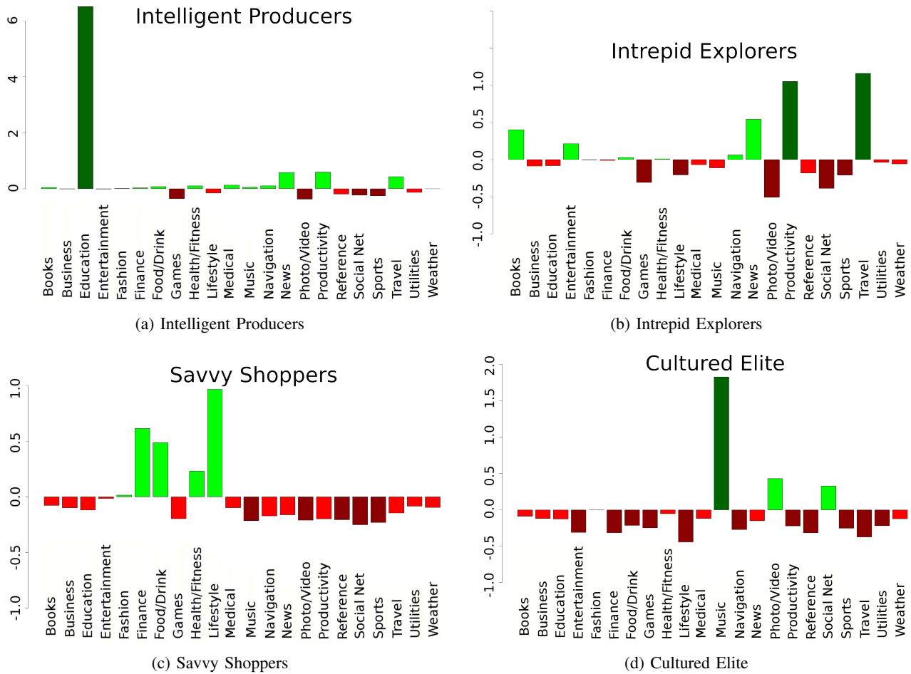
Fig. 2: Profiles of the different user clusters