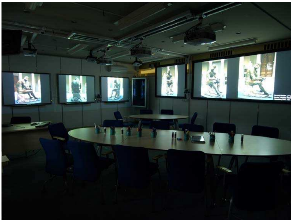
Fig. 1. A multi-display learning space at the University of Nottingham. © Brett Bligh, 2010.

Multi-Slides 25 is a plug-in for Microsoft PowerPoint which allows the presentation slides to be cascaded simultaneously across multiple screens, as shown in Fig. 1. The information resolution of the presentation, i.e., the amount of information that can be seen at the same time, is therefore increased. Sets of slides juxtaposed together in space form a display ecology of shared information, rather than only being encountered one at a time. Somewhat ironically, given our prior discussion of its limitations, a perceived advantage of Multi-Slides was that users could call upon their existing skills when authoring presentation materials by using PowerPoint itself. Later, at the presentation venue, the cascade of presentation materials is easy to set up by using a dialog box where the order in which material is displayed across the various screens is defined. In the seminar room used for this work, six large screens were available across two walls of the room. The slide cascade was set to move across the screens in order from left to right. 26