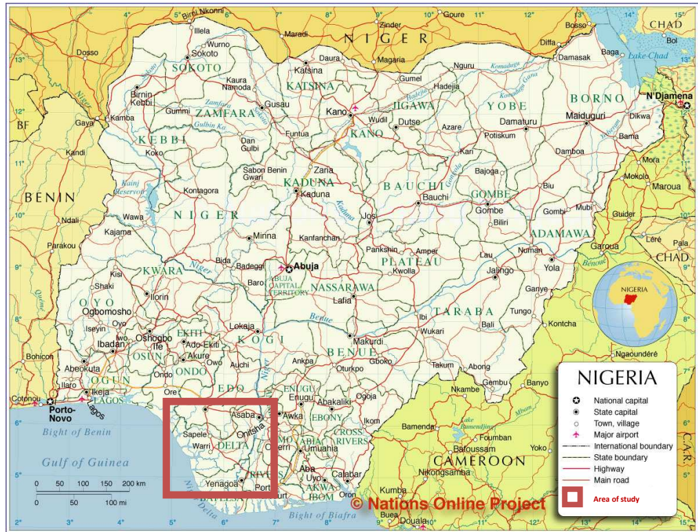
Figure 3.1: Map of Nigeria showing area of study