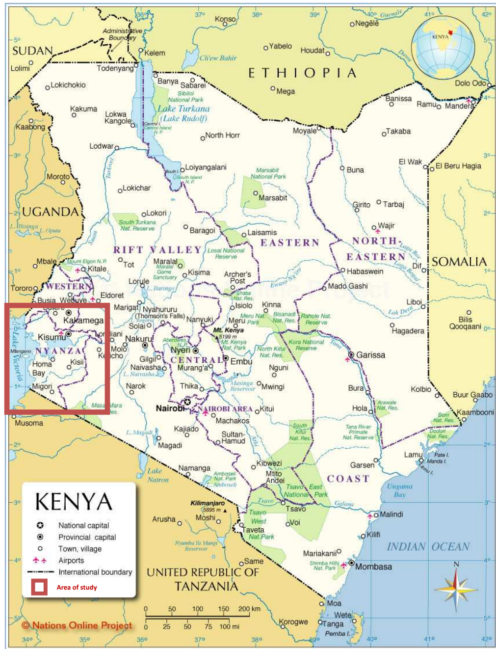
Figure 3.2: Map of Kenya showing area of study

Source: The Nations Online project ( http://www.nationsonline.org/oneworld/map/kenya_map.htm ). Accessed December 2010.