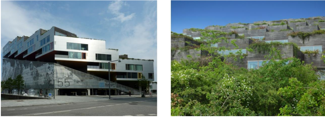
Figure 4. VM Mountain in Ørestad, Copenhagen (Denmark). Source: Authors.