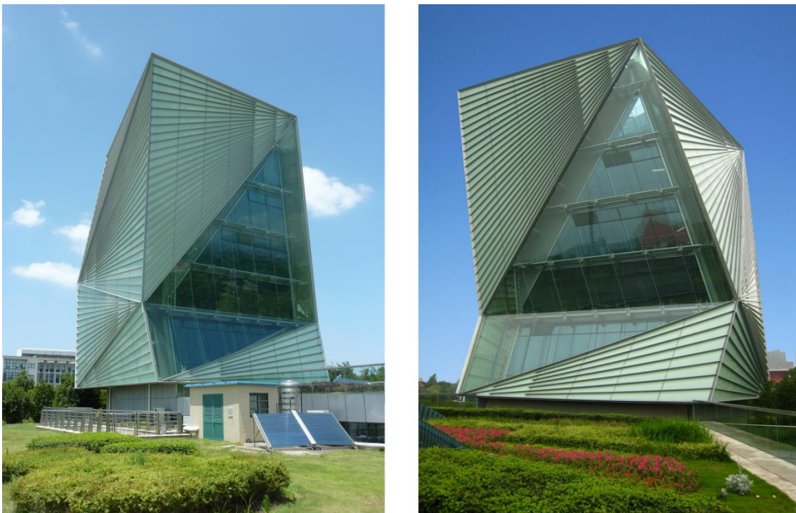
Figure 2. The CSET, University of Nottingham Ningbo (China).

graduate students, the purpose of design aesthetics has been explored primarily in terms of its social functions and cultural benefits, promoting the role of design as a model of innovative construction, financial viability, and effective energy performance in practice. Inspired by Chinese lanterns and traditional wooden screens, the CSET – China's first zero carbon university building – has been conceived as a ‘beacon’, a demonstrator of state-of-the-art techniques for environmentally responsible design and renewable energy technology that can inspire change and re-orient the building industry in a highly dynamic construction environment.